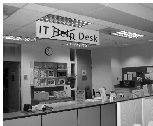
A newly imposed modification to the IT (Help) Desk sign.

"Do you know what IT stands for?" asked the anonymous person. "I'll tell you. It stands for Infested with Termites. Tell me, how long do you think an IT desk can really last? Not long at all. We'll soon all be calling it the 'Pile Formerly Known As The IT Desk'."