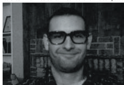
Information Technology Minion: "Well duh, that's because I went back in time and prevented you from buying one!" (Subliminal message: The outage was not IT's fault)