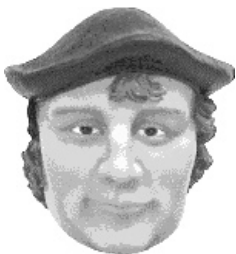
It all began with the Martin Luther Bobble....