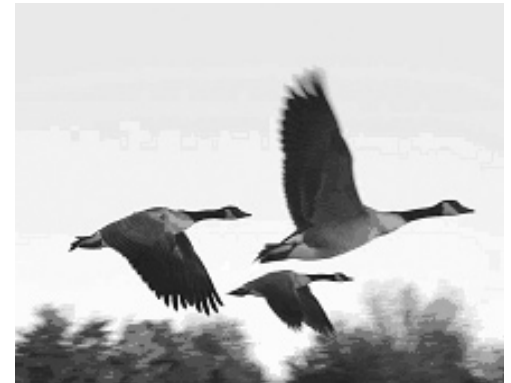
A Ganderian attack squadron descends upon Concordia.